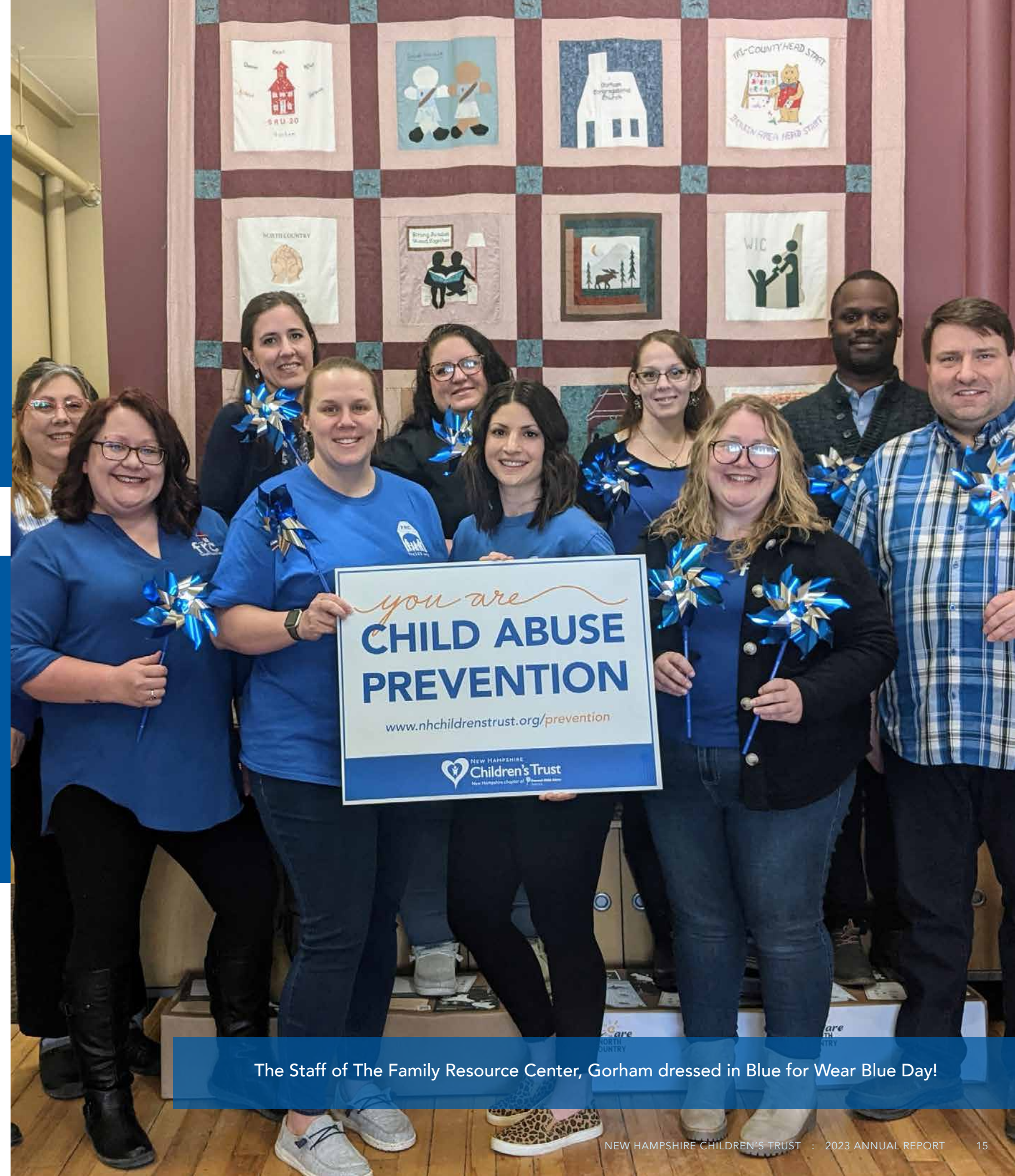
The Staff of The Family Resource Center, Gorham dressed in Blue for Wear Blue Day!